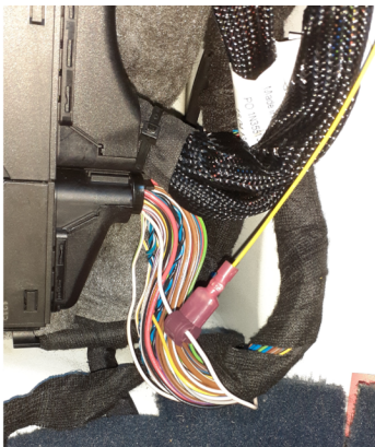
FIG 2 - Brake Switch over pedal